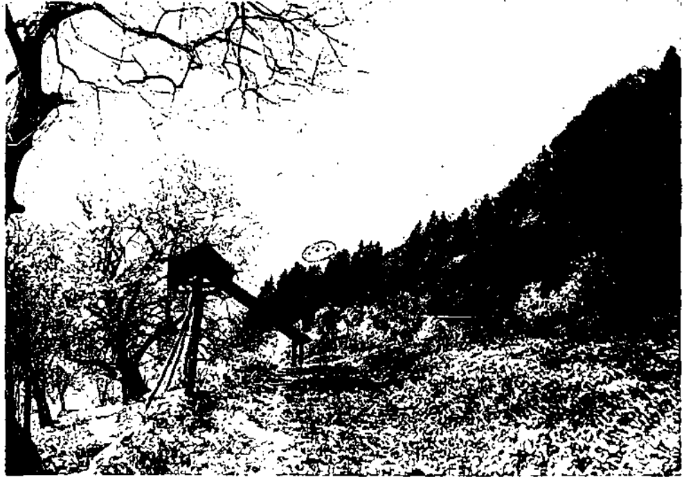
UFO is reconstructed over actual photograph of the area.

Not long time ago UFO-NLP Sekcija ZVEZA SOLT Studentsko naselje blok VII 61000 Ljubljana, Slovenija, Yugoslavia, which is the oldest and most known UFO organization in Yugoslavia, sent a letter describing a UFO spotting. Two of our members went to the field investigation, and in order to obtain the most faithful picture of the event. We arrived to a little idyllic village, near Senozeti. It is situated some 18 kilometers (ten miles) from Ljubljana, its altitude being relatively high, about 700 meters above sea level. The village offers a beautiful view on the surrounding hills. We soon came into contact with the two main eyewitnesses, Metoda G, 18 years old. (We have their address in our files) She sent us the above-mentioned letter, and her mother Helena G.