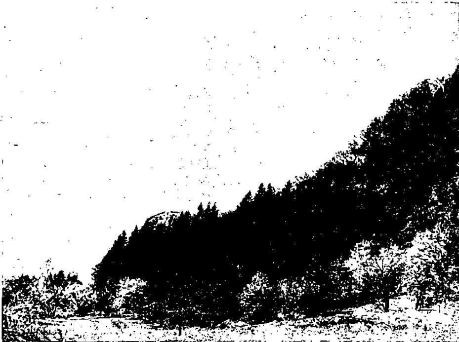
Another reconstructed photograph of UFO and actual area in which it was seen.

far from our house. We listened attentively but there was no sound whatsoever, coming from around us. There was complete silence. Neither did we notice any smoke or something like that coming from the spot. We really did not know what it was all about. People who know us belived us for they know we do not tell lies.