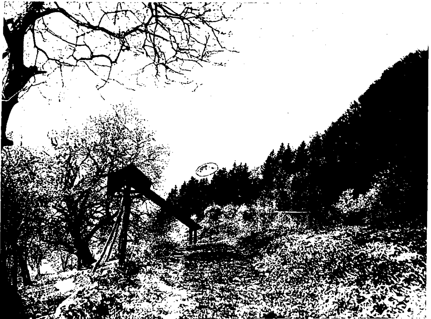
Reconstructed photograph of area near Senozeti, Yugoslavia, where several people witnessed a UFO in February, 1977.